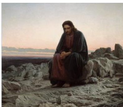
Christ in the Wilderness by Ivan Kramskoy, 1872

Lent is a desert journey. It is forty days of solitude because we draw aside from the noise and confusion of the world in order to strengthen and deepen our relationship with the Lord. It is a time of combat because we must do battle with a wide array of "wild beasts." We are not contending with "flesh and blood," but, as St. Paul teaches us, "with the principalities, with the powers, with the world rulers of this present darkness, with the evil spirits in the heavens" (Eph 6:12). We need an accurate and honest understanding of what tends to interfere with our relationship with God – our sin patterns, attachments, bad habits and weaknesses. Perhaps we lack courage, or we are judgmental, or we are prone to gossip. We may be especially vulnerable to the temptations that come to us through social media, such as pornography, which has trapped so many souls and injured so many families.